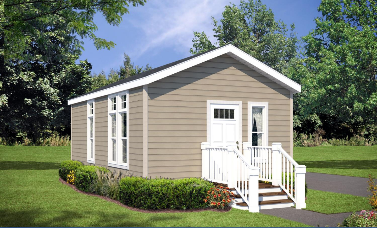
Athens Park Model Model 529 | 1 bed-1 bath | 390 sq ft